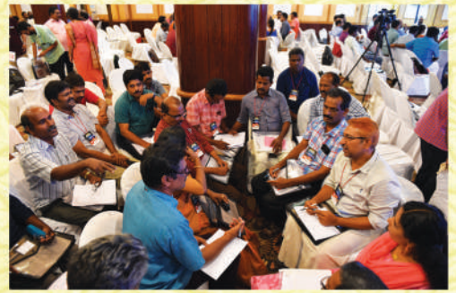
People's Energy for New Kerala Workshop Organised by KSEB Workers Association