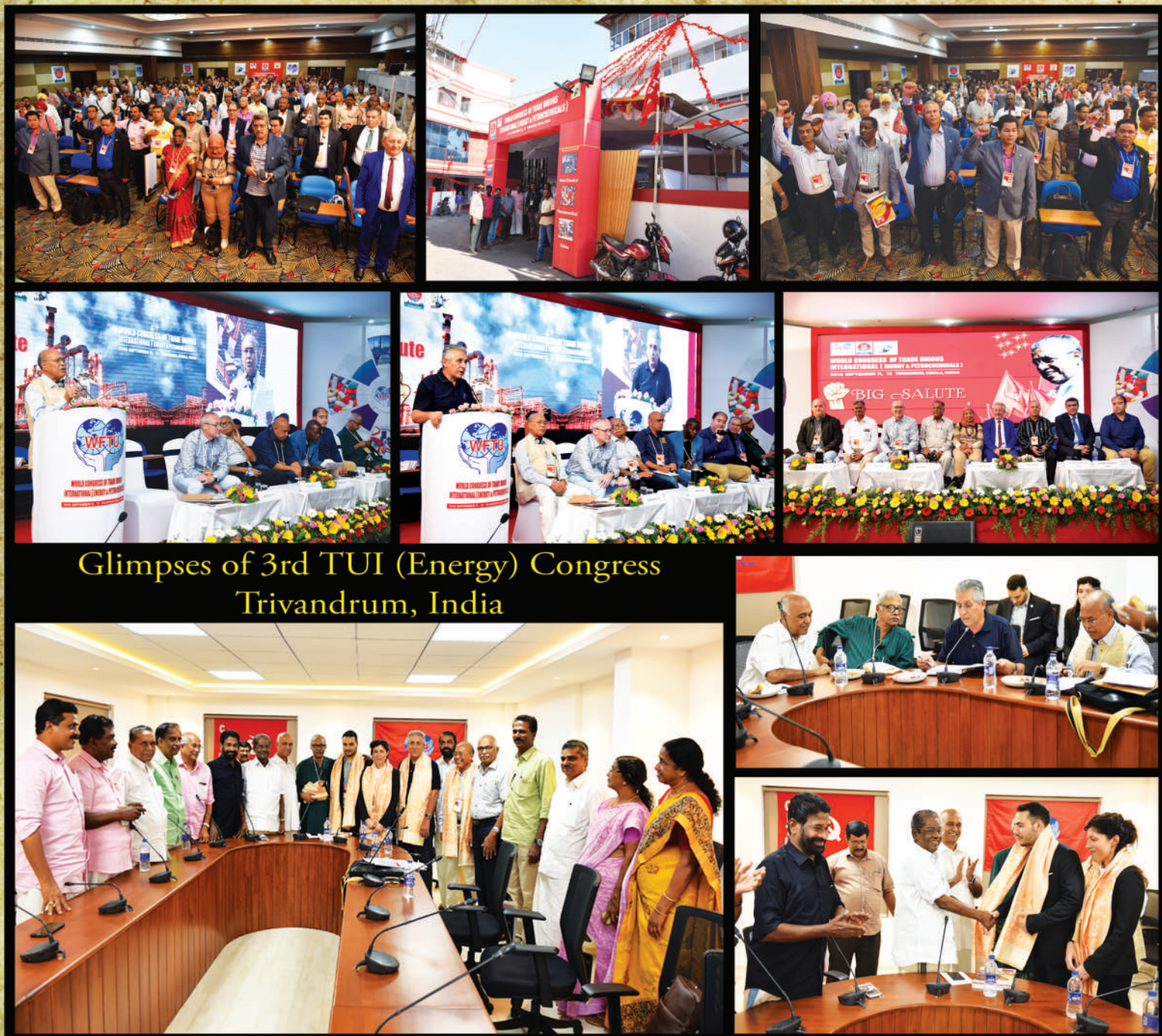
Glimpses of 3rd TUI (Energy) Congress Trivandrum, India